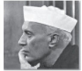
Central Prison, Naini October 26, 1930